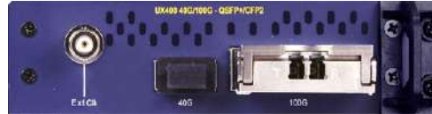
QSFP+ and CFP2