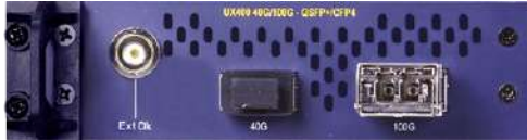
QSFP+ and CFP4